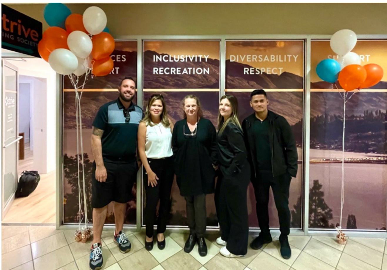
New Strive Centre Kelowna Grand Opening May 2024

Programs operating in Kelowna now include Assisted Independent Living, Supported Independent Living, Adult Staffed Living, Children and Youth Family Care, and the Strive Centre.