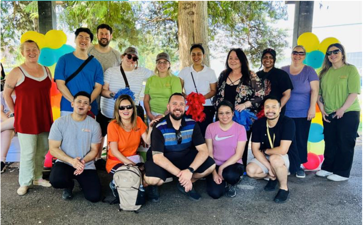
Strive participation in Activate Inclusion Day: Empowering Inclusive Sports