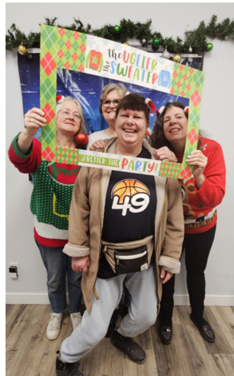
Headway New Westminster Christmas Party